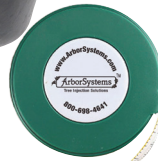
Diameter Tape Measure